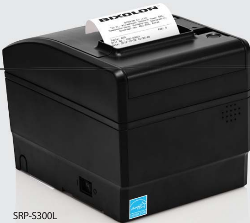
SRP-S300L Liner-Free Label Printer